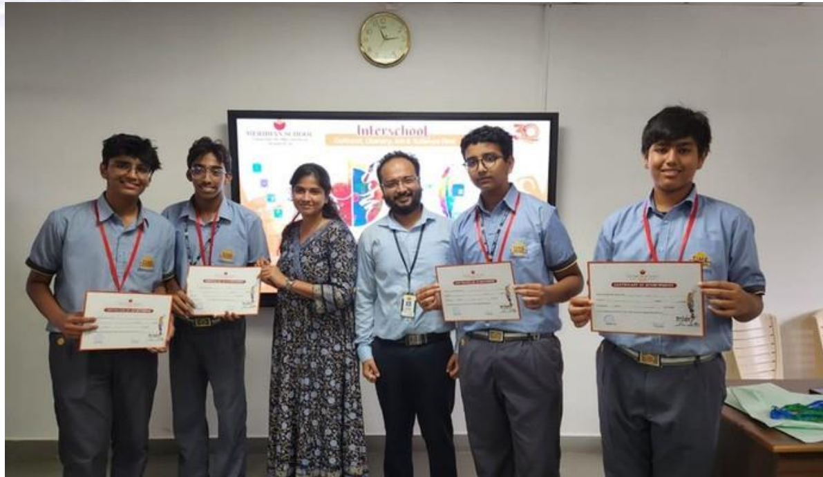
Class 9 students won THE 3rd prize in Inter-school Photography Competition