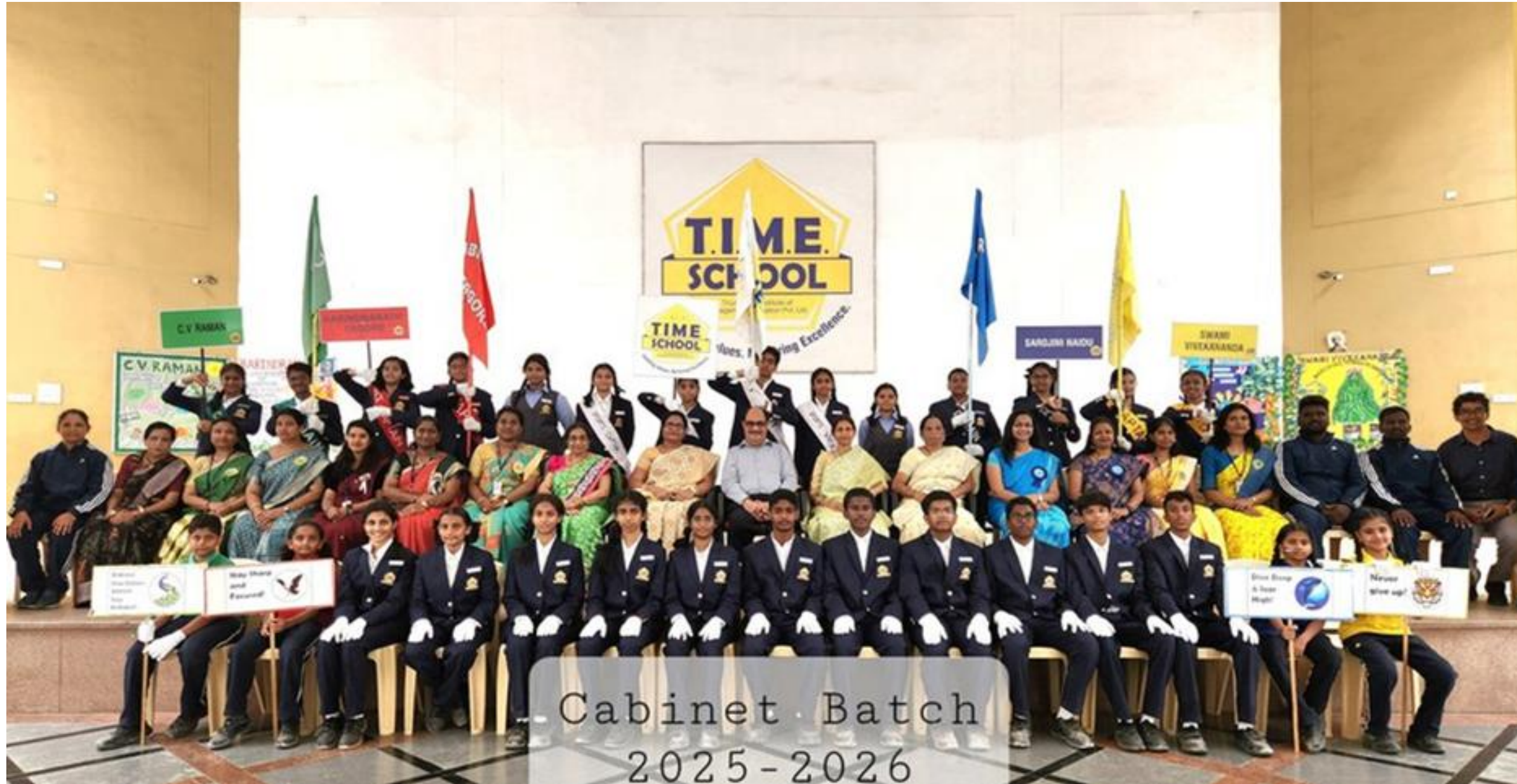
Cabinet Batch 2025-2026