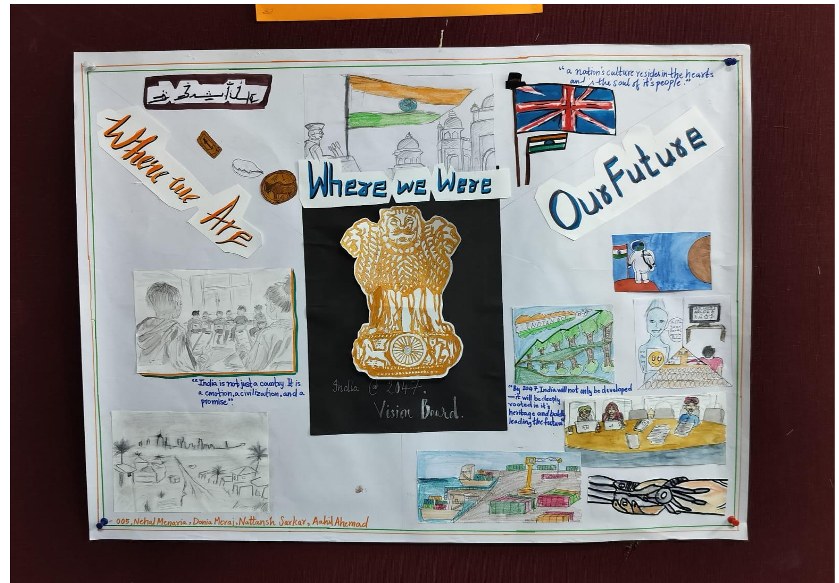
OUR WINNING ENTRY FOR THE VISION BOARD IN 'MELANGE'